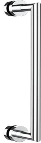
Large Rosette (Large 1 1/2")